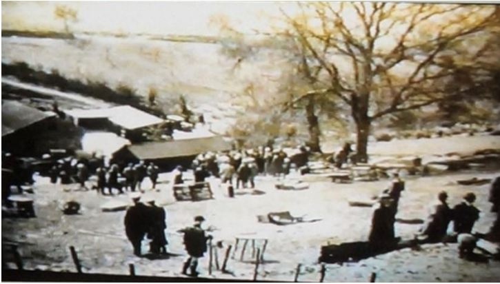
Farm Sale 1951

The farm sale in 1951 refers to the selling of livestock and machinery/implements by auction on site when an owner is selling up or a tenant is retiring; very important for the latter and their pension fund. Neighbouring farmers would support the sale and the vendors would provide refreshments. The author remembers being taken to such sales in the 1950s when a teenager in South Wales.