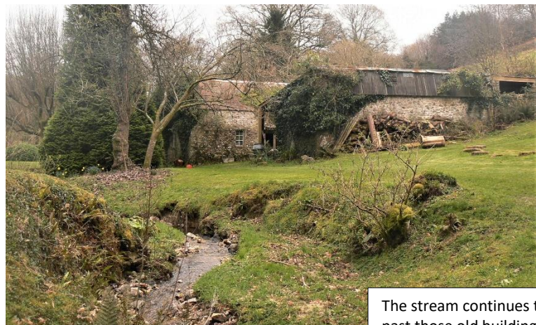
The stream continues to flow past those old buildings

A reminder of past orchards. West Hill had 2 acres of orchards in the 1840s. The apples were used for eating, cooking and making cider. The exhibition team estimated from the tithe map that there were 147 orchards in Uplyme covering 100 acres.