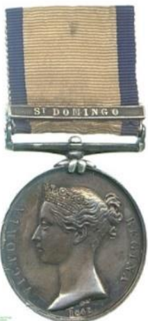
Naval General Service Medal, with bar for St Domingo 1848

The Lester Watson Collection Fitzwilliam Museum, Cambridge