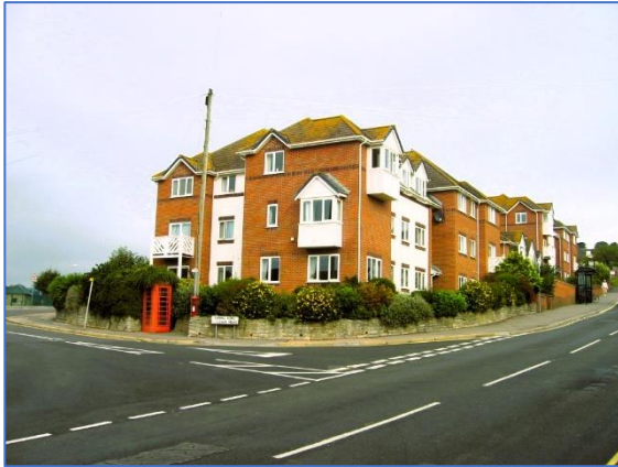
Cloverdale Court Flats 2005

Today, the Cloverdale Court flats are situated at the northern side of the junction between Charmouth Road and Anning Road, on the site of the former Cloverdale garage and petrol station.