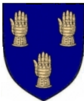
Fane family Coat of Arms