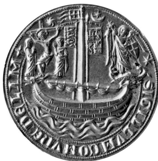
Fig 2 Impression of the Lyme Regis Seal

The Seal of Lyme Regis ( Fig 2 ) shows a cob, a single masted merchant ship of the late 13th century, with a pennon at the masthead depicting the Cross of St. George. On the sides of the mast are two banners: one with the three lions of England, the other with a castle and a lion rampant. These were the arms of King Edward I and his first wife, Queen Eleanor of Castile. At the bow of the vessel the Crucifixion is shown with the Virgin and St. John. At the stern is St. Michael, patron saint of Lyme Regis, holding a crozier and slaying the dragon. On his left arm is a shield with the Cross of St. George. On the border appear the sun, moon and a star with the words 'Sigillum Commune De Lim' ( Common Seal of Lim ).