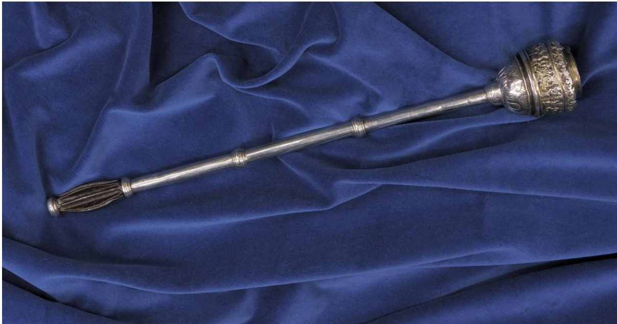
Fig 1 The Lyme Regis Ancient Mace

Most interestingly, Lyme Regis also has a smaller Ancient Mace that has, for centuries, been carried by the Mayor in procession.