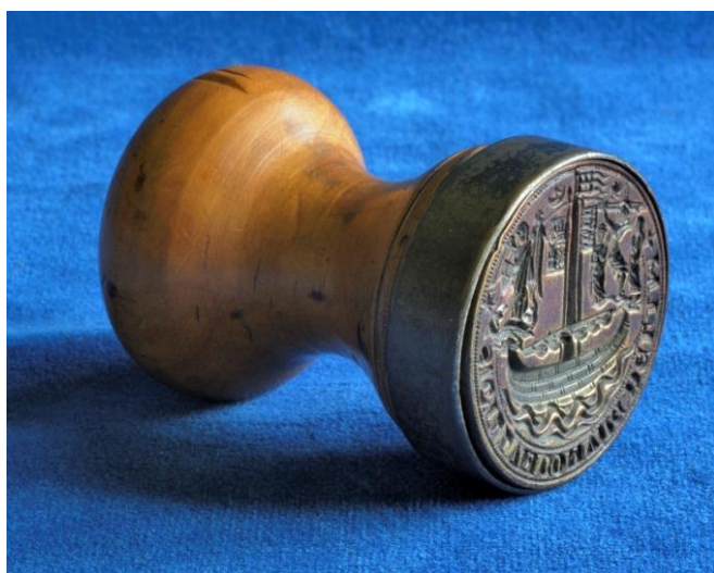
Fig 1 The Lyme Regis Seal

The town's brass seal matrix is 52mm in diameter mounted in silver plate with a turned wooden handle. ( Fig 1 )