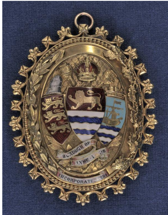
The Mayor's Pendant

The main gold pendant depicts, at its centre, the town's Coat of Arms and the words 'Borough of Lyme Regis incorporated 1284'. The reverse is inscribed 'Presented to the Borough of Lyme Regis, in commemoration of the glorious reign of Her Majesty, Queen Victoria on the occasion of the Coronation of the King Edward VII June 1902'. Have you spotted the error?