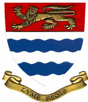
Lyme Regis Coat of Arms