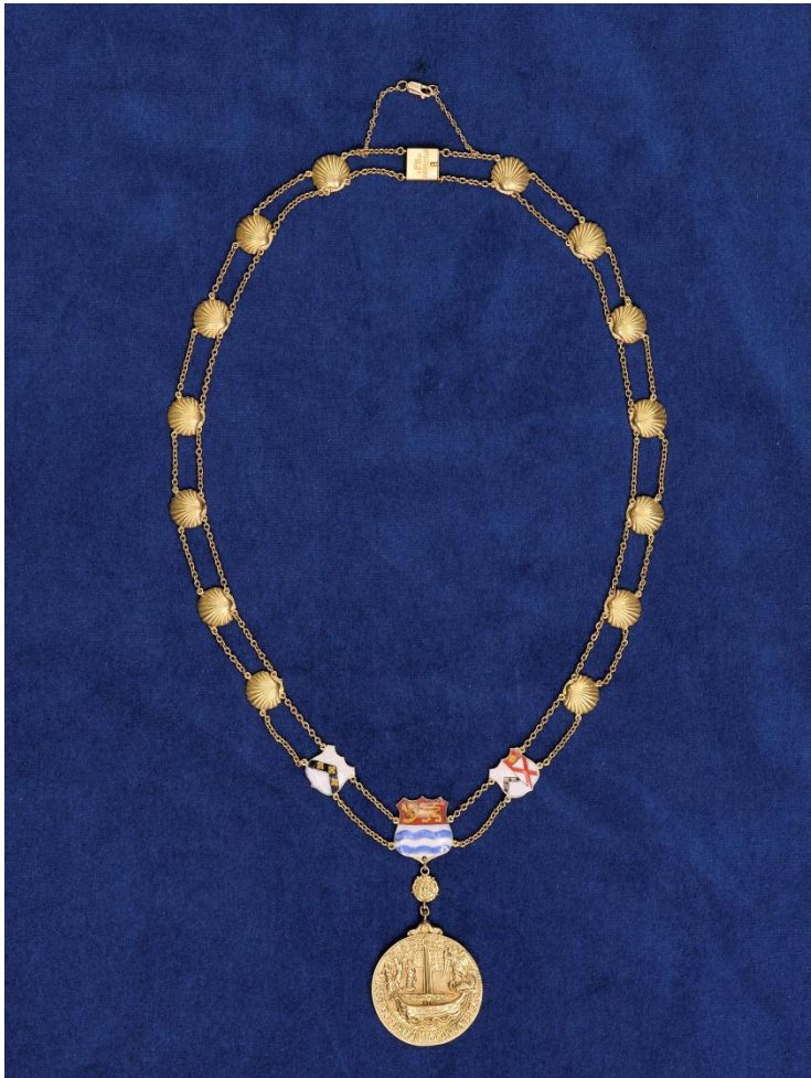
The Mayoress' Chain of Office