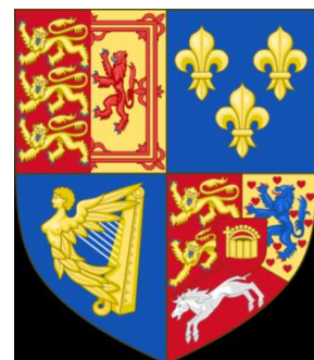
King George II Coat of Arms