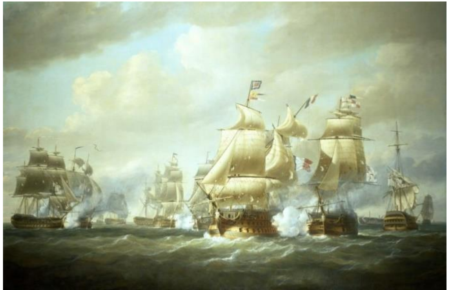
Duckworth's Action off San Domingo, 6 February 1806 painted by Nicholas Pocock (1740-1821)

The battle of St (San) Domingo was an engagement of British and French Squadrons on 6 th February 1806 in the Caribbean, off the French-occupied Spanish colony of St Domingo. The small British fleet, commanded by Rear Admiral John Thomas Duckworth, won the battle which was memorable for its severe fighting at close range. Losses: British, 340 dead or wounded; French, 1,500 dead or wounded, 5 ships captured or destroyed.