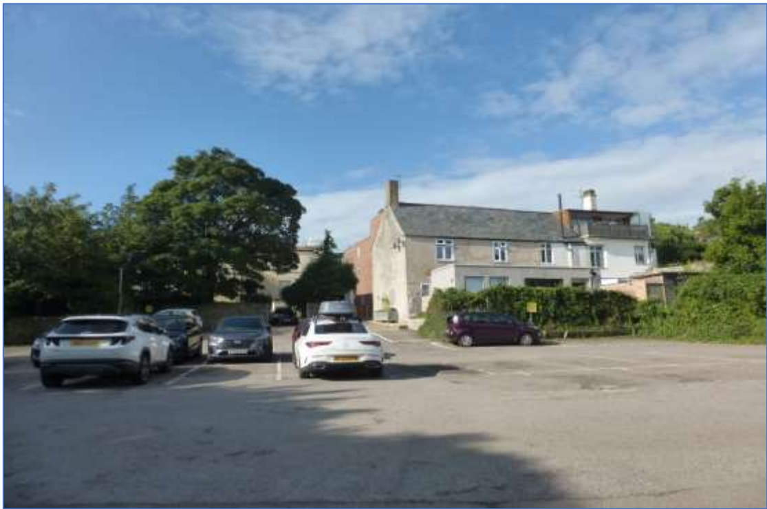
Pitt House and NCP Car Park, July 2023